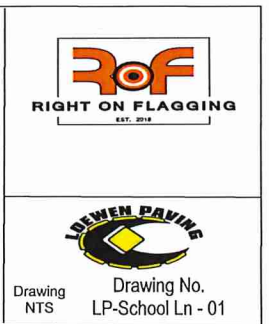
Figure # 7.8 in the TCMWR 2015 Edition Single Lane Alternating This Traffic Control Plan is designed to accommodate patch work at 6840 School Ln through the Collins intersection on School Ln 25m South. Work to commence Friday, Aug. 17th, 2018 and is expected to be completed in one day, however permit will be requested for a week. Work hours shall be from 7:00 am - 5:00 pm All signs and traffic devices shall be placed in compliance with WCB and the TCMWR